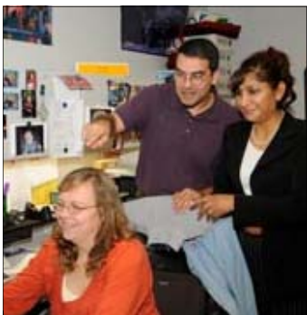
APS's CTAE Staff