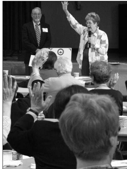
Voting at the annual meeting

While strictly adhering to this policy, ALRI does urge all members to provide email addresses for internal use. The email addresses in the ALRI data base are especially valuable resources for communicating last minute scheduling changes as well as special event announcements, and members are urged to keep ALRI's administration informed when email addresses (or phone numbers) are changed.